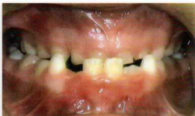
COMPLETE CLASS III